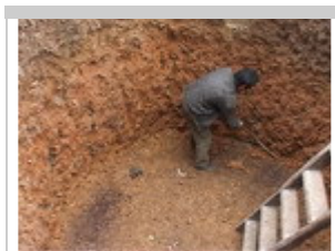
1. dig a hole in ground

The plant can be constructed from concrete using steel moulds (like the Puxin biogas plants).