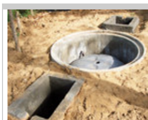
8. fix the gasholder in the digester neck