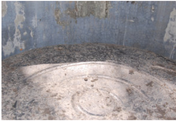
Fig III Gas dome in water jacket