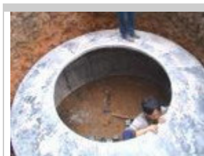
2. assemble the tank stomach mould