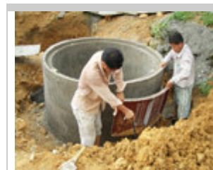
6. disassemble the mould