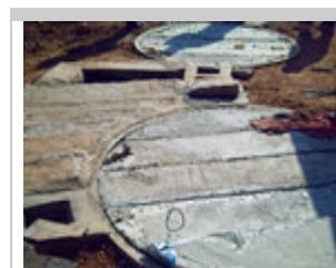
9. cover the digester neck outlet

The gasholder with an inner diameter of 1.5 m is the upside down bottom of a plastic water tank ( 3 000 l). This is an expensive option. For large scale dissemination a cheaper (waste) plastic or a fibre