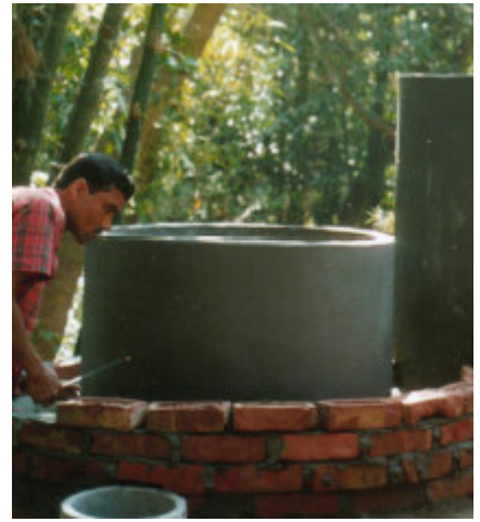
fig IV Construction of a water jacket plant (In the foreground the large inlet).

The plant can be constructed from concrete using steel moulds (like the Puxin biogas plants).